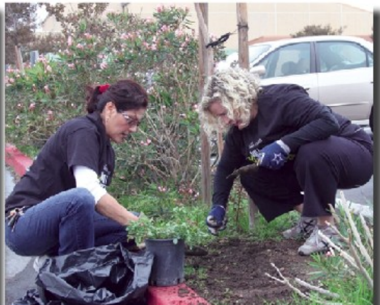
La Mesa Jr. High