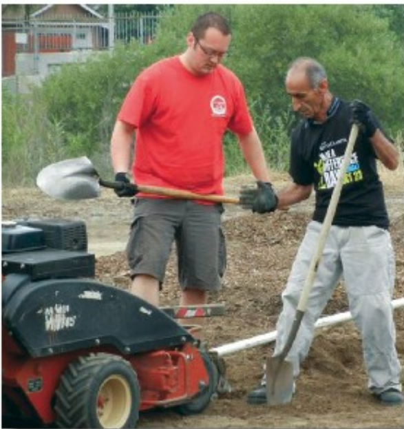
Making a difference

Photos from the 2011 Make a Difference Day