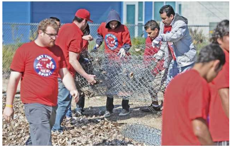
2011 Neighborhood Clean Up Volunteers

Contact (661) 286-4098 for a program application and more information.