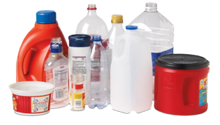
Empty Plastic Bottles and Containers