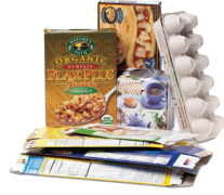
Clean Paper Bags, Magazines, Cardboard, Newspaper, Junk Mail and Paper