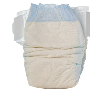
Diapers and Pet Waste