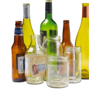
Empty Glass Bottles and Jars