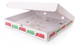
Food Soiled Paper