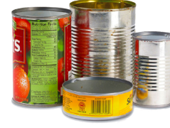
Empty Aluminum Cans, Containers and Clean Foil