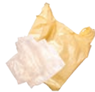
Plastic Bags & Film