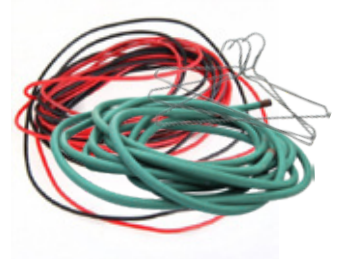
Hoses, Cords & Wire (Electrical wires are e-waste. Refer to Hazardous Waste Disposal Information)