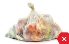
NO Plastic Bags of Any Kind