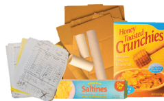
Paper, Flattened Cardboard & Paperboard