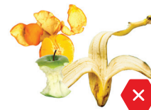
NO Food or Liquids