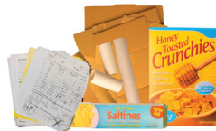
Paper, Flattened Cardboard & Paperboard