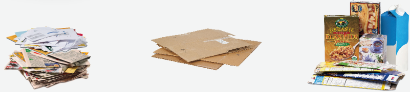
Clean Paper, Magazines, Newspaper, Cardboard, Junk Mail, Paper Beverage Cartons (must be empty)