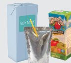
Drink & Beverage Cartons, Boxes / Pouches (Multi-material Packaging)