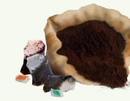
Coffee Grounds & Tea Bags