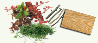
Yard Waste, Untreated Wood

Plastic cups, straws, or utensils that are labeled "compostable" or "biodegradable" are not allowed in the Organics containers.