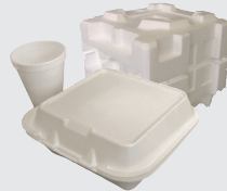
Polystyrene Foam & Packaging