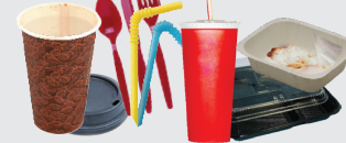
Plastic Lined Paper Cups & Lids, Plastic Utensils & Straws, To Go Containers (Including "compostable" plastic)