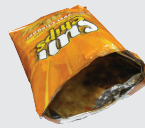
Snack & Chip Bags, Candy Wrappers