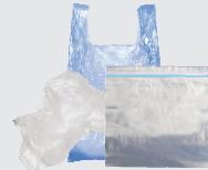
Plastic Wrap, Bags & Other Plastic Film