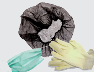
Disposable Gloves & Hairnets