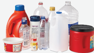
Empty Plastic Bottles & Containers (Lids should be left on after emptying contents)