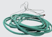
Hoses, Cords & Wire