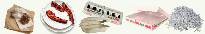
Food-Soiled Paper, Napkins, Paper Towels, Pizza Boxes, Cardboard Egg Cartons, Non-coated (plastic lined) Take-out Containers & Paper Plates (No surface sheen), Shredded Paper