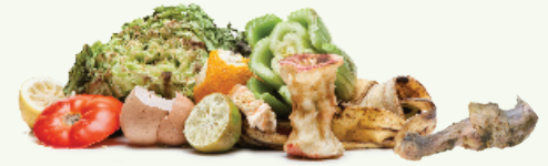
Food Scraps, Including Egg Shells, Meat & Bones

Materials must fit inside a container with the lid shut when serviced or you may be charged. If you regularly have excess materials, call WM at (510) 537-5500 to help you right-size your service.