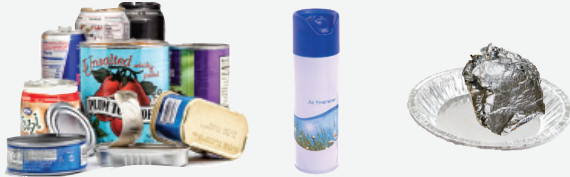
All Metal Beverage & Food Cans, Empty Aerosol Cans, Clean Aluminum Pans & Foil