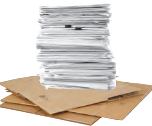
Office Paper, Magazines, Newspaper, Cardboard, Junk Mail