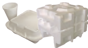
Polystyrene Foam & Packaging