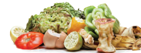
Unpackaged Food Scraps Such As: Fruits, Vegetables, Grains & Bread, Eggshells, Cooked Meat & Bones, Plate Scrapings