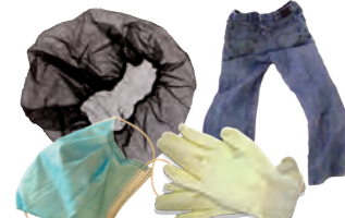
Disposable Gloves, Hairnets, Clothing (Donate Clothing if Gently Used)