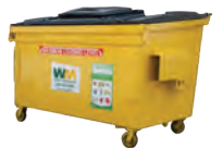
Two-yard bin offered in some areas.