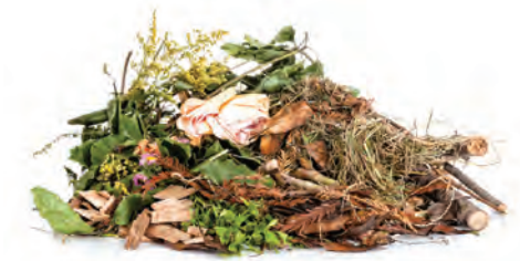
Grass, Weeds, Green Plants, Tree Limbs, Wood Chips, Dead Plants, Brush, Garden Trimmings, Leaves