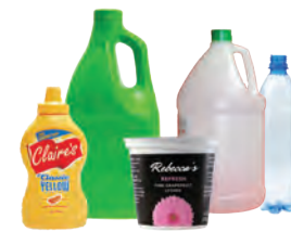
Empty Plastic Bottles & Rigid Plastic Containers #1, #2 & #5 Plastics Only