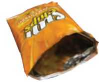
Snack & Chip Bags, Candy Wrappers

No loose plastic bags. Surcharges may apply for contamination.