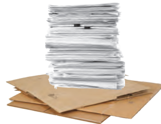
Office Paper, Magazines, Newspaper, Cardboard, Junk Mail