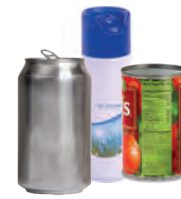
All Metal Beverage & Food Cans, Aerosol Cans