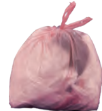
Bundled Plastic Bags & Films