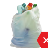
Do Not Bag Recyclables