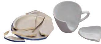
Broken Ceramic & Dishes (Please Wrap)