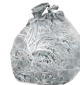
Shredded Paper (Must be bagged in Clear Bag)