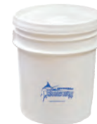
Large Plastic Tubs