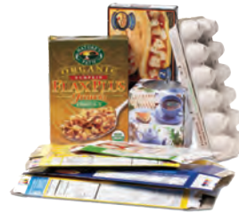
Food Boxes, Paper Egg Cartons