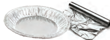
Clean Aluminum Pans & Foil