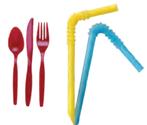
Plastic Utensils, Plastic Straws & Cup Lids