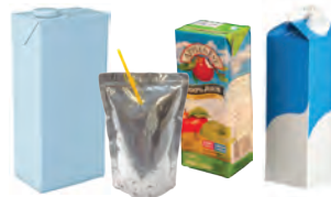
Beverage Boxes & Pouches (Multi-material Packaging)

NO DIRT, ROCK, SOD, PALM FRONDS, CACTI, ICE PLANT OR SUCCULENTS