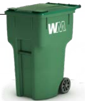
Old Color Scheme