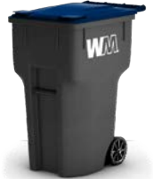
New Color Scheme