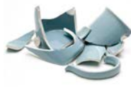
Broken Ceramic Dishes & Pots