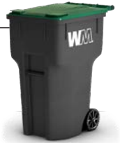
New Color Scheme