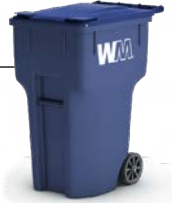
Old Color Scheme