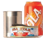
Food & Beverage Cans