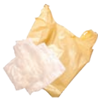
Plastic Bags & Film