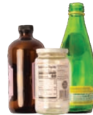
Glass Bottles & Containers