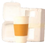
Foam Cups & Containers