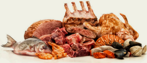
MEAT, FISH, & POULTRY