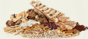
BREAD, PASTA, RICE, GRAINS, COFFEE GROUND, & FOOD SOILED PAPER