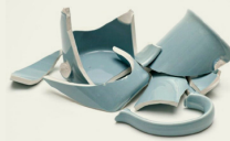
BROKEN CERAMIC DISHES & POTS