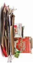
Flattened Cardboard & Paperboard

Cardboard, paper, newspaper, paperboard, magazines