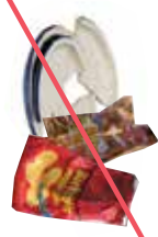
NO Food Wrappers & Broken Dishes