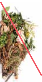
NO Yard Waste & Grass Clippings