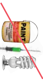
NO Hazardous or Medical Waste