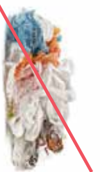
NO Plastic Bags & Film