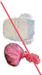
NO Diapers & Pet Waste