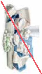
NO Foam Cups & Containers