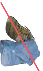
NO Clothing & Shoes