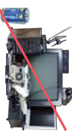
NO Electronics & Batteries