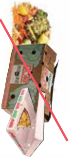
NO Food, Food-soiled Paper, Waxed Cardboard

You have heard the saying, “one bad apple can spoil the bunch.” The same goes for recycling. We need your help to keep these items out of the recycling cart.