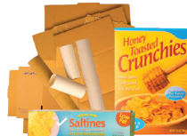
Flattened Cardboard & Paperboard