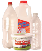
Plastic Bottles & Containers