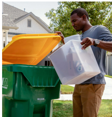
KEEP RECYCABLES LOOSE