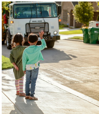
GIVE TRUCKS A WIDE BERTH