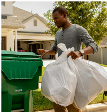
BAG AND SECURE TRASH