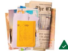
Paper, Newspaper & Magazines