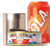
Food & Beverage Cans