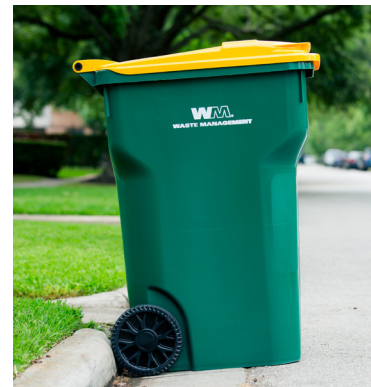
PRACTICE PROPER CART USE